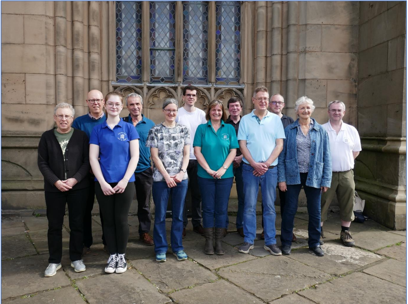
The Cheltenham Band – anticlockwise from bottom right

which certainly focuses the mind – there is no hiding. The atmosphere was so very friendly and it was great to have the opportunity to meet with old friends who were ringing or supporting the other teams. Is it worth the effort? Undoubtedly yes because, as with any striking competition, the practicing and the contest itself, forces you to think about your technique and accuracy, which improves your ringing back in the real world of weekly practicing and Sunday service ringing.